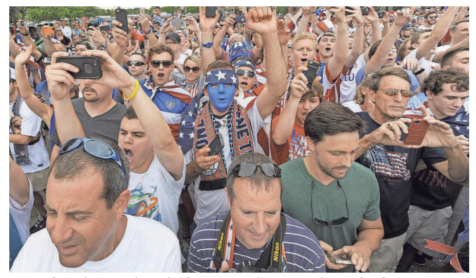
Soccer fans cheer on the United States men's team as they arrive for a 2014 game against Nigeria.

4812 Deer Lake Drive West, Jacksonville, FL 32246